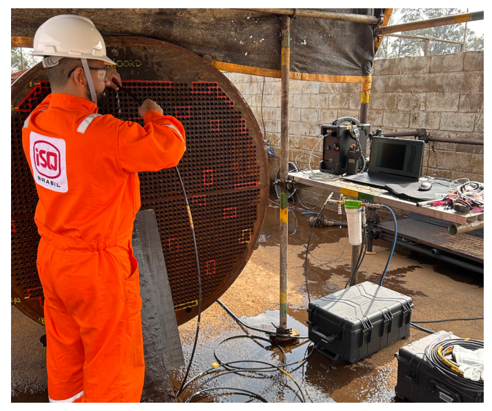
Figure 4: Heat exchanger inspection using the internal rotary inspection system (IRIS) with Ectane 3.