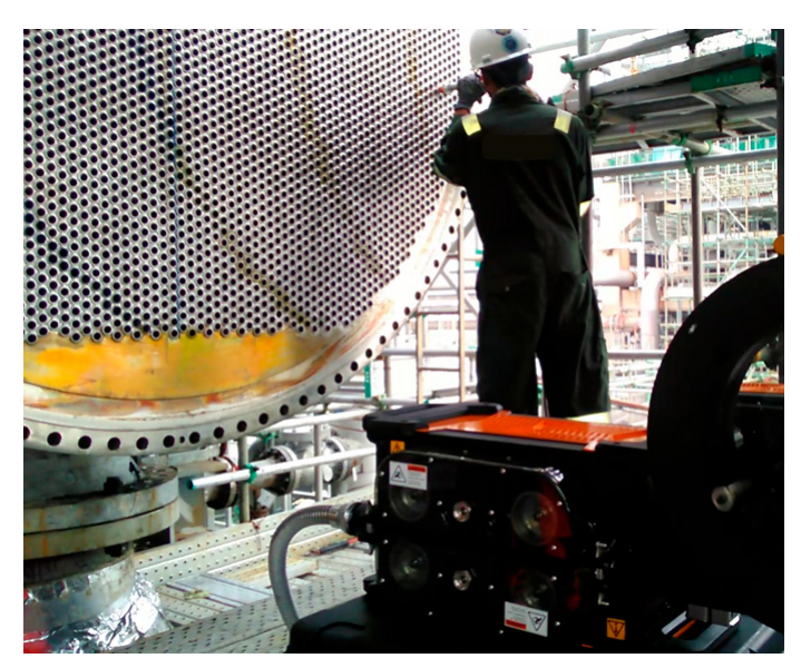
Figure 3: Heat exchanger inspection using the Probot.

Probot™ is Eddyfi Technologies' advanced probe pusher-puller compatible with Ectane 3 and Magnifi software. By enabling constant and optimal probe pulling speed, it supports the acquisition of high-quality encoded data. Designed for oneperson operation, the Probot is controlled directly through the software interface. The solution ensures precise defect positioning and tackles the most critical heat exchanger inspections with efficiency.