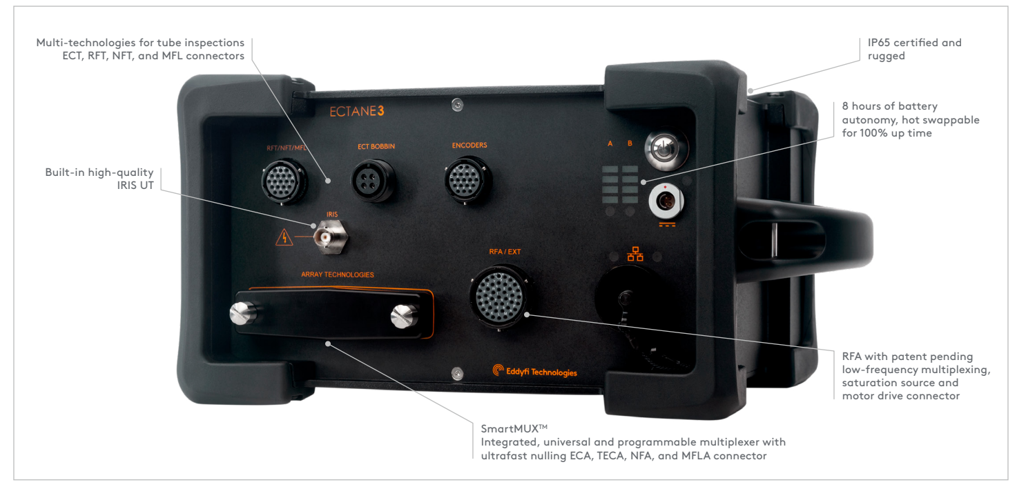
Figure 2: Annotated breakdown of Ectane 3 showing its key features.