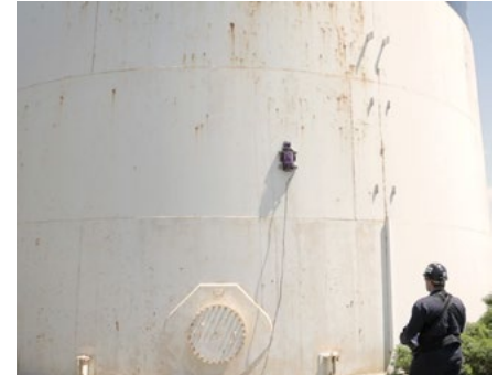
Remote crawler tank shell inspection